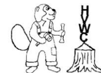
"CHIPS" the club logo.